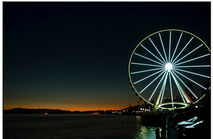
Photo of Seattle